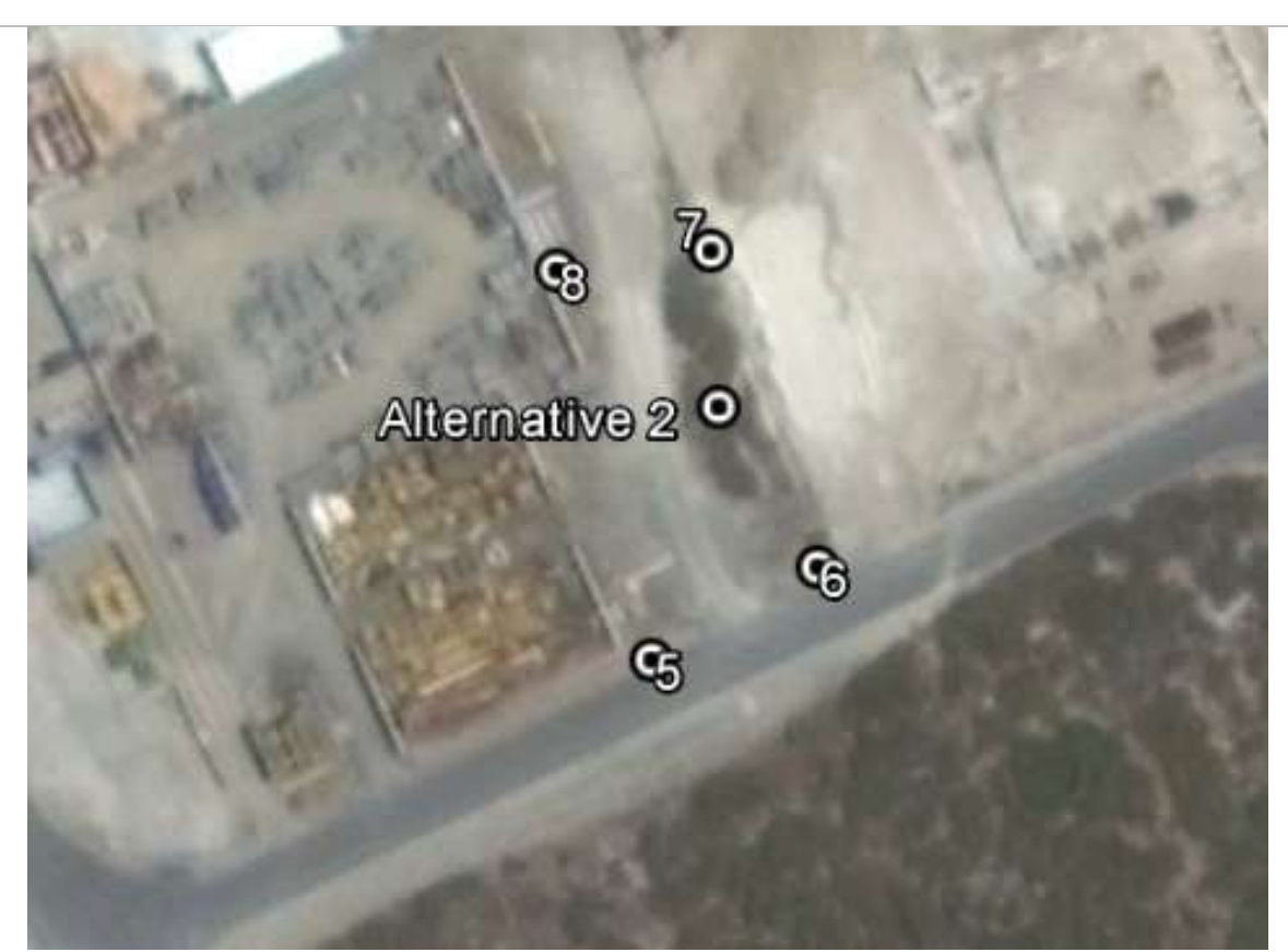
Figure 6: Google Earth image of the proposed development site showing points from where photographs were taken at Alternative 2.