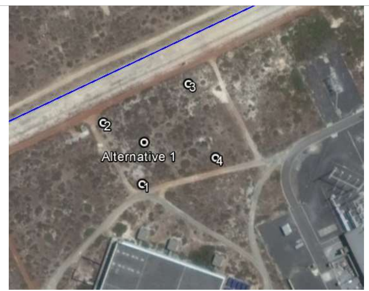
Figure 1: Google Earth image of the proposed development site showing points from where photographs were taken at Alternative 1.