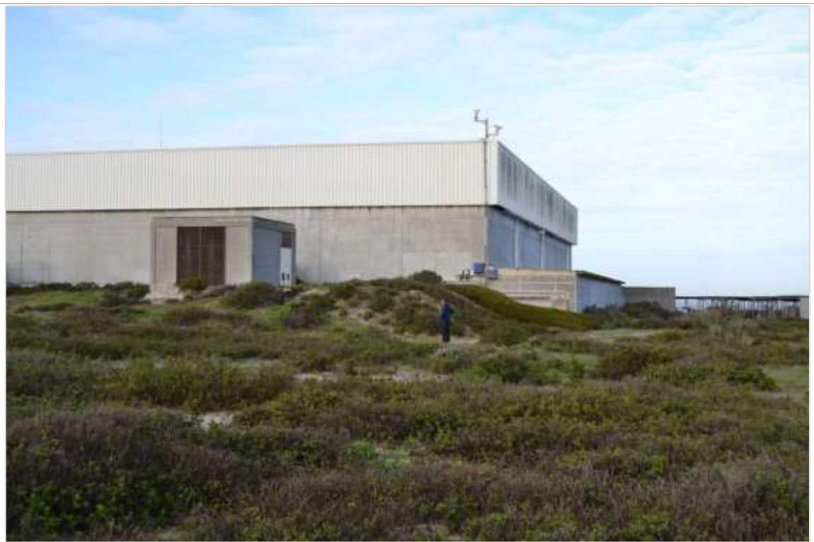
Figure 4: Photo the proposed development site looking in a south-western direction (taken from point 3).

The proposed development site as well as high-voltage lines and associated buildings are visible in the background.