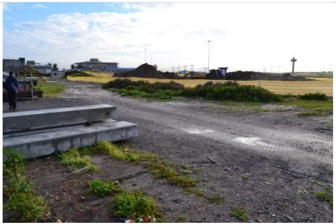
Figure 7: Photo of the proposed development site looking in a northern direction (taken from point 5).

The extent of the proposed development site with other approved developments beyond the site boundaries can be viewed from this photograph.