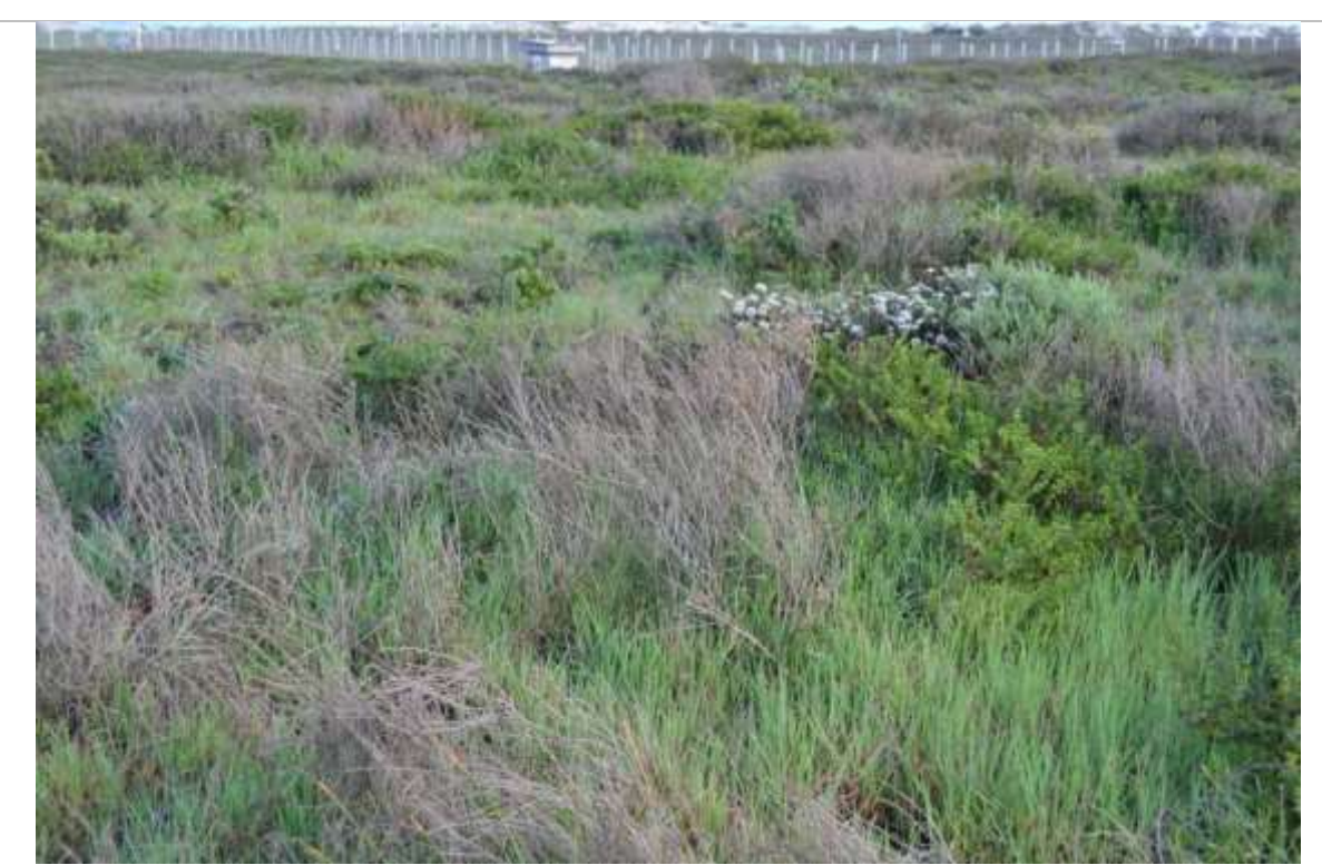
Figure 5: Photo of the proposed development site looking in a north-western direction (taken from point 4).

The extent of the proposed development site with the security fence in the background can be viewed from this photograph.