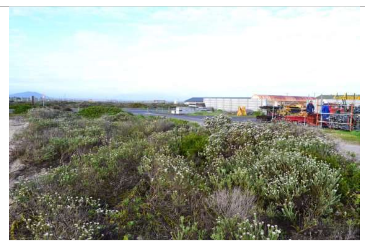
Figure 8: Photo of the proposed development site looking in a northern direction (taken from point 6).