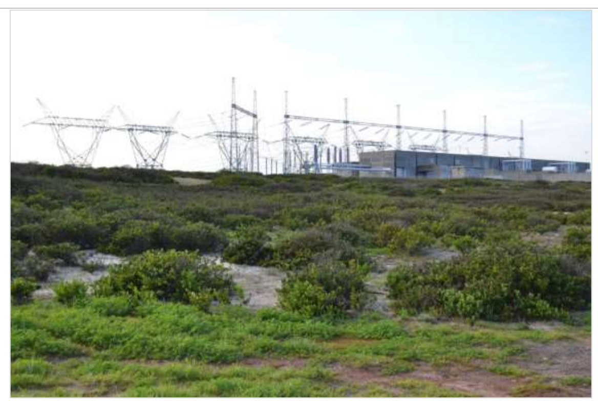
Figure 3: Photo of the proposed development site looking in a north-eastern direction (taken from point 2).

The proposed development site as well as high-voltage lines and associated buildings are visible in the background.