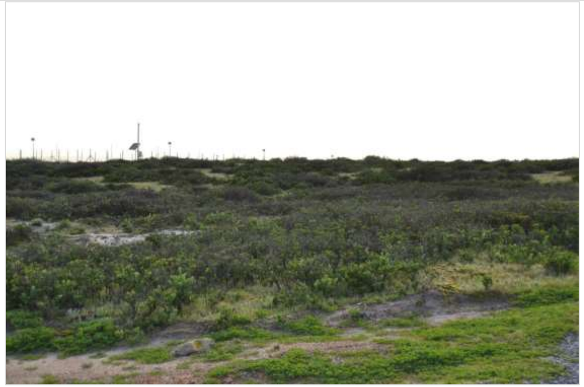
Figure 2: Photo of the proposed development site looking in a northern direction (taken from point 1).

The extent of the proposed development site with the security fence in the background can be viewed from this photograph.