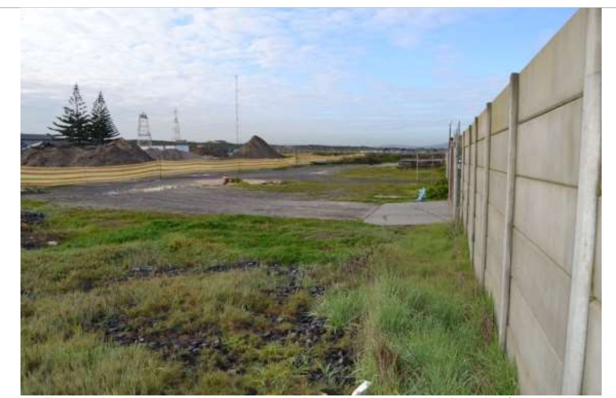
Figure 10: Photo the proposed development site looking in a southern direction (taken from point 8).